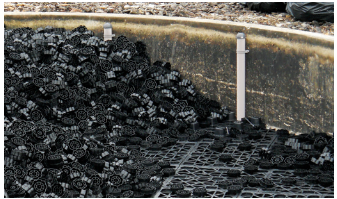
Adding media to shallow trickling filter (N-Dec 330 shown here.)